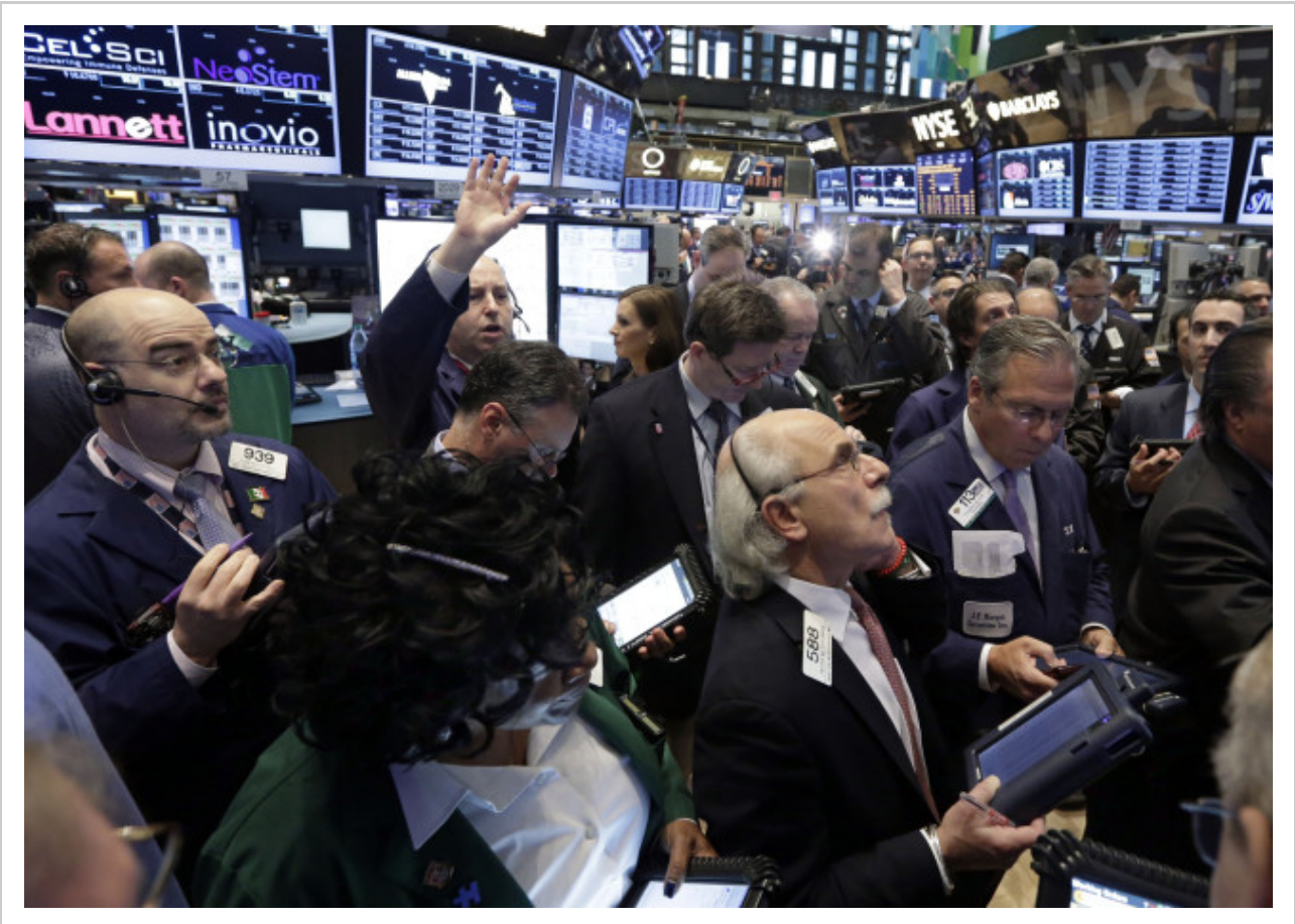
The vast bulk of the global elite's wealth is based on the dream of future growth

Something that is only dimly understood outside financial circles is that the vast bulk of the wealth enjoyed by the global elite is based on a fabrication: a belief in the future growth in earnings that corporations will deliver. For example, the <u>current P/E ratio</u> of the S&P 500 is about 23, which means that investors are valuing companies at twenty-three times their earnings for this year. Another way of looking at it is that less than 5% of the wealth enjoyed by investors relates to current activity; the rest is based on the dream of future growth.