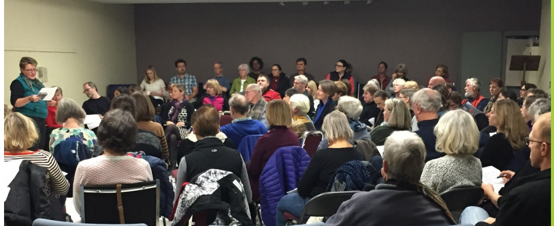
Ottawa Centre Refugee Action (OCRA) 17 Nov 2015 Community Meeting