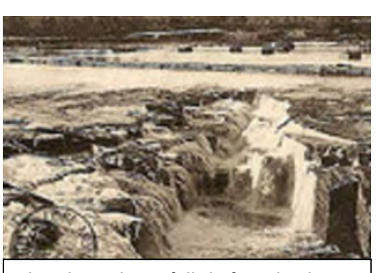
This photo shows falls before the dam was built to power industry in 1908

The Chaudière Falls were sadly submerged and effaced by construction of the Ring Dam across its entire span in 1908. Prior to that, they were Ottawa's